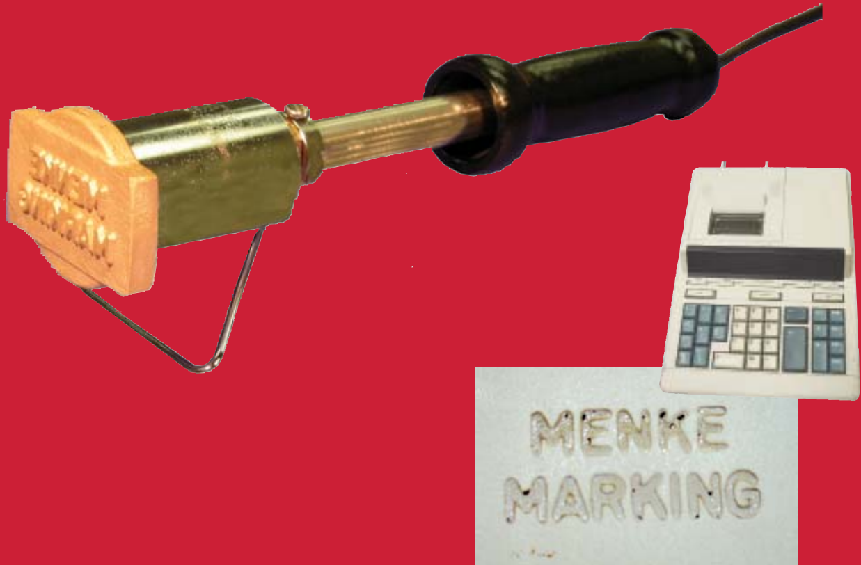
Permanently identify office and computer equipment